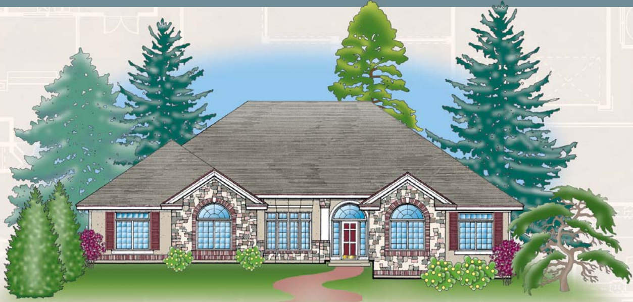
ELEVATION 2608 RANCHER