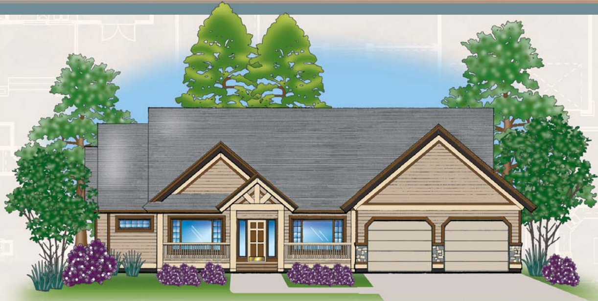
ELEVATION 2235 RANCHER