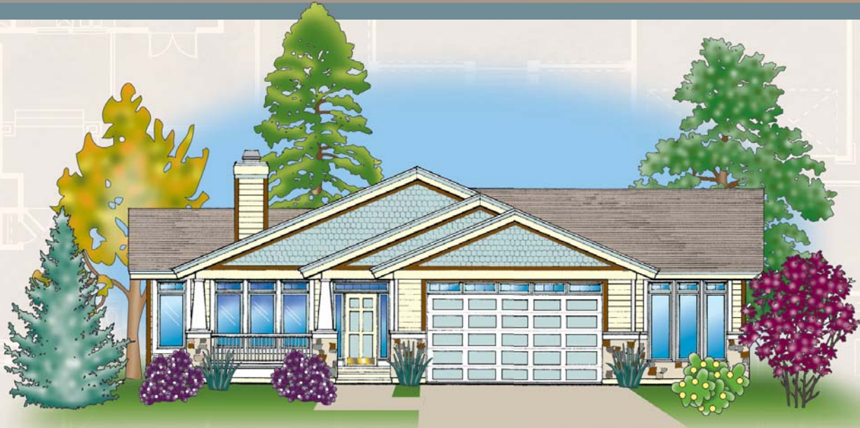
ELEVATION 1669 RANCHER